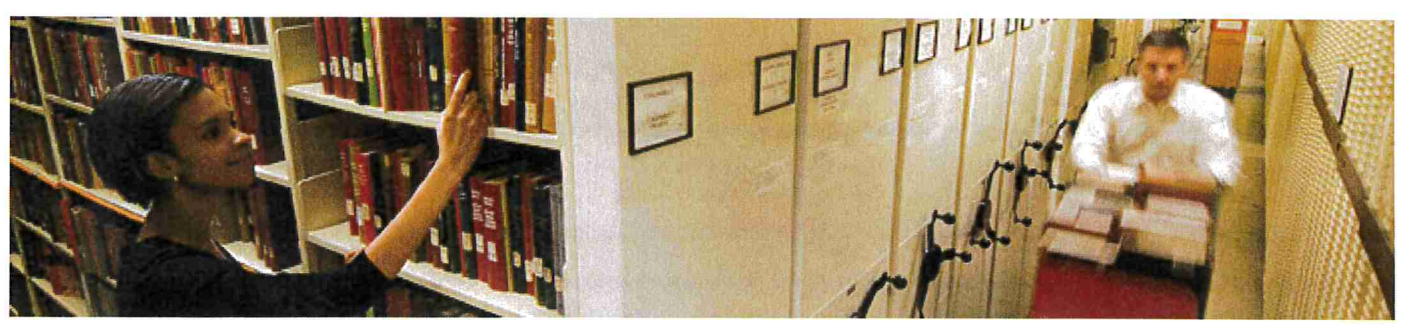
Research & Reports | Guide to Law Online | Legal Research Guides | Legal Topics | Guides to Our Collections Back to Research & Reports

The guides listed below provide commentary and recommended resources for selected national observances and commemorative months.