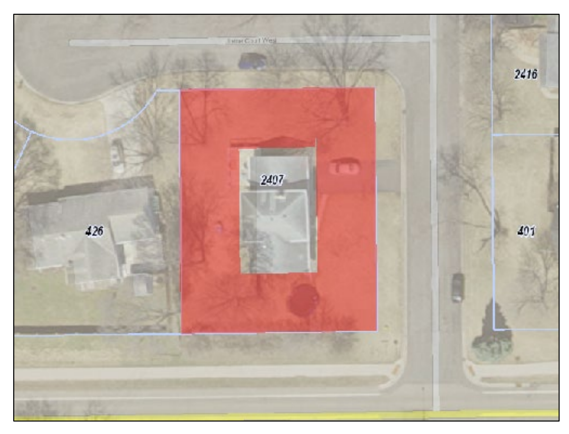
Typical condition setback requirements – north side of the lot is the front:

Current condition setback requirements – west side of the lot is the front: