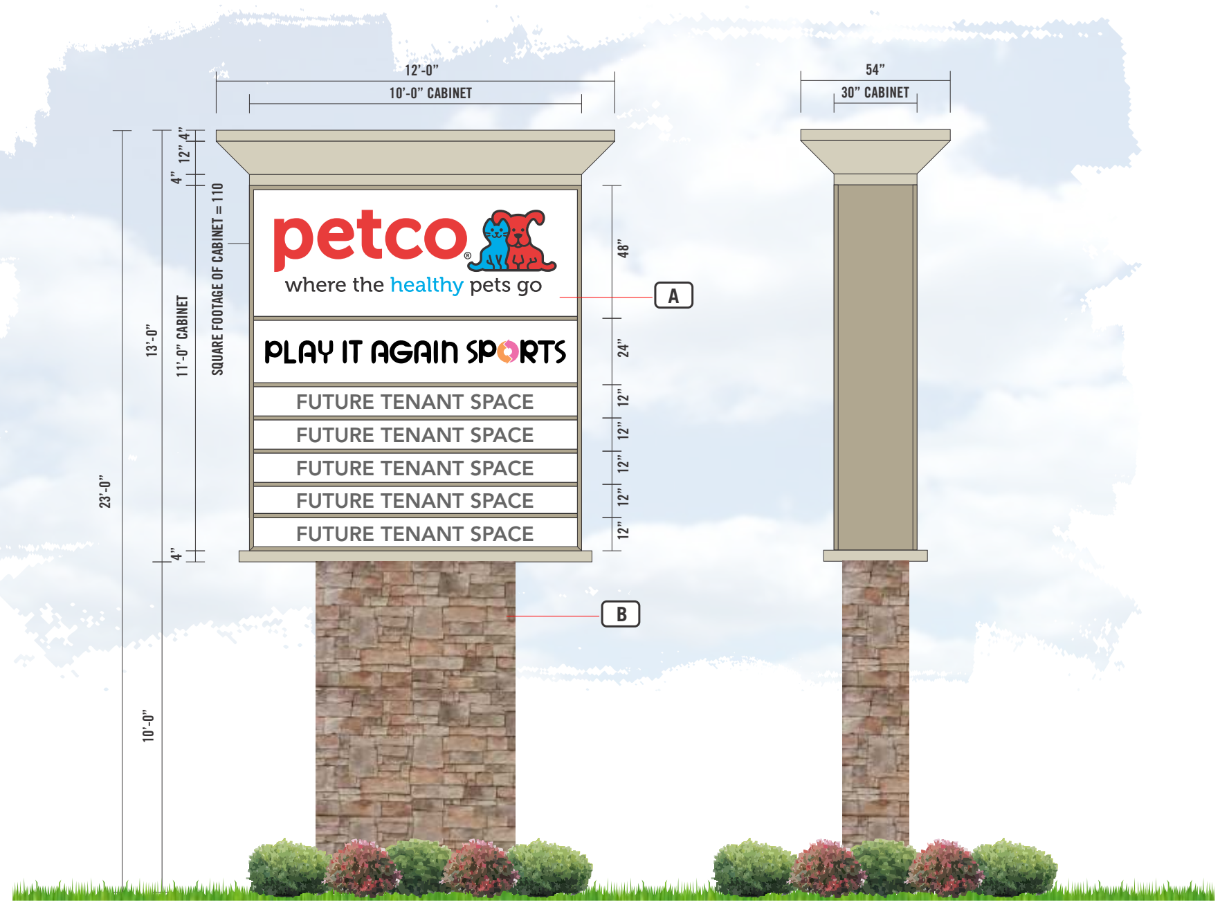
1 D/F ILLUMINATED MONUMENT SCALE: 1/4"=1'-0"